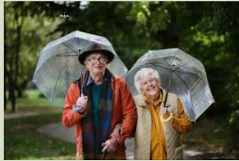
Let's hope for the best!